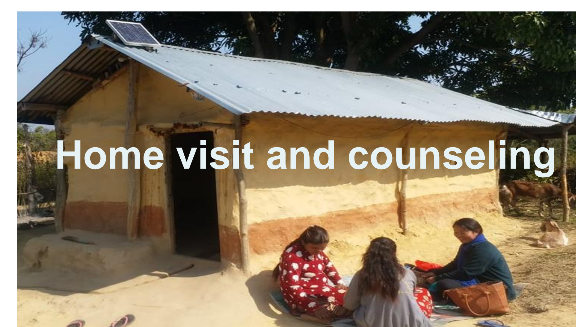
Home visit and counseling